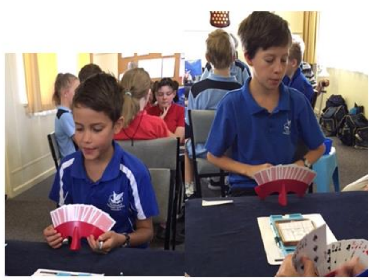
The Bridge Team – "You gotta know when to hold em...know when to fold em...