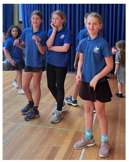
Active After School and After School Care.